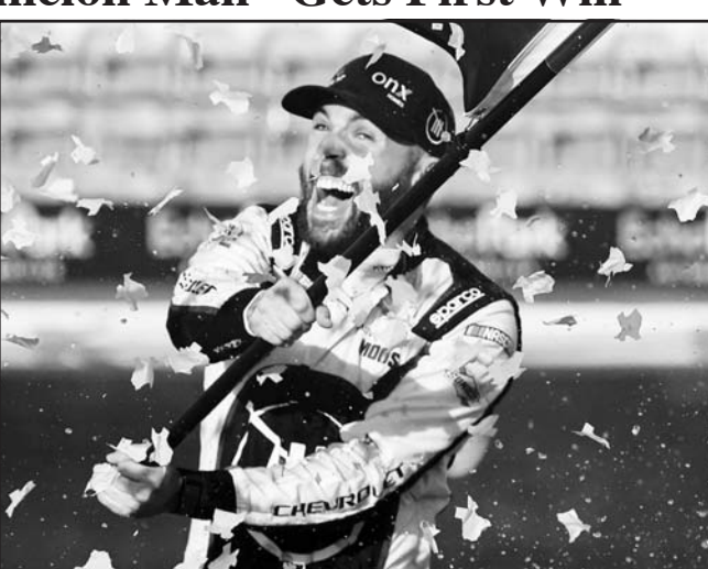
The "Watermelon Man" Gets First Win

Top 10 leaders after 6 of 36: 1. Elliott-200, 2. Blaney-195, 3. Logano-185, 4. Bowman-183, 5. Chastain-180, 6. Byron-175, 7. Truex Jr.-172, 8. Almirola-168, 9. Briscoe-166, 10. Reddick-158.